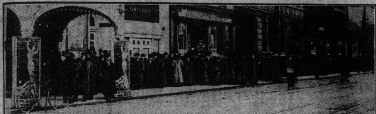
ANXIOUS CROWD IN LINE FOR "BEN-HUR."