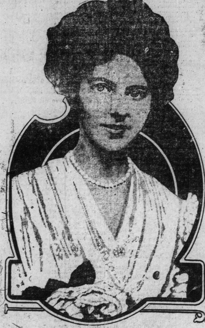
ELEANOR ALEXANDER, THE NEW YORK GIRL WHO WILL WED THEODORE ROOSEVELT, JR., SHORTLY AFTER COL. ROOSEVELT'S RETURN FROM AFRICA.