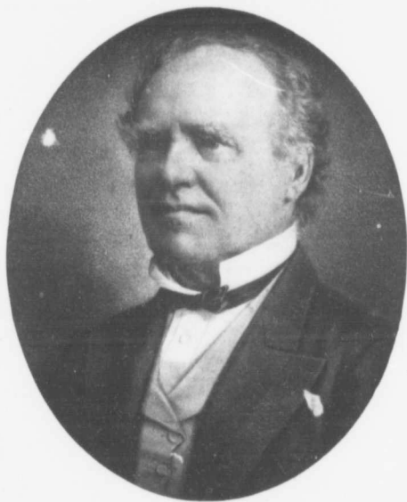
HON. JOSEPH HOWE.