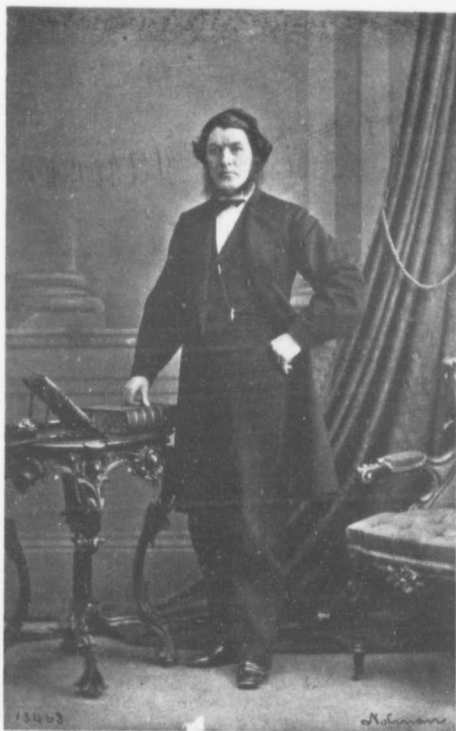
HON. CHARLES TUPPER, M.D.

ohn, ized who, the aims the ring stion even and nore ig to