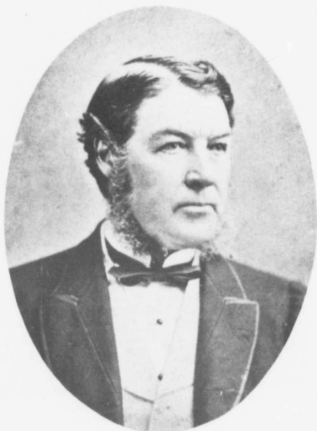
HON. CHARLES TUPPER, M.D., C.B.

eks of nstone rnment health duties e when tion of having nequal counter- a about rave in m, Eng-