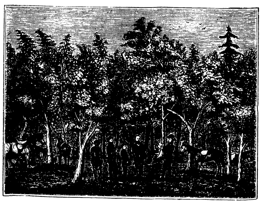
CHURCH PARADE IN THE WILDERNESS.

God. There was no artistic pre-said one of the miners. "There is," paration; roughly clad, with no audience, it was the simple prayer up a little sooner you would have heard which Nature bids the creature render the service going on." "Oh yes," to his Creator. After service, which said he, "we heard it for the last mile;"