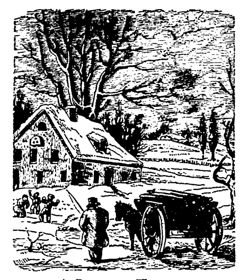
A CANADIAN HOMESTEAD.

Perhaps the most satisfactory feature of this rapid growth is, that under it the salaries of the Clergy, not promised but paid, have increased from a dead level of one hundred pounds sterling to a scale of from $600 to $850 per annum, graded according to term of service. Sixty new Churches and twenty-nine new Parsonages have been built. Local Endowments for thirty-five Parishes, which now amount to $113,000, have been founded. A Pension Fund for aged and infirm Clergy, begun twenty-five years ago, on the twenty-fifth Anniversary of the Church Society, at