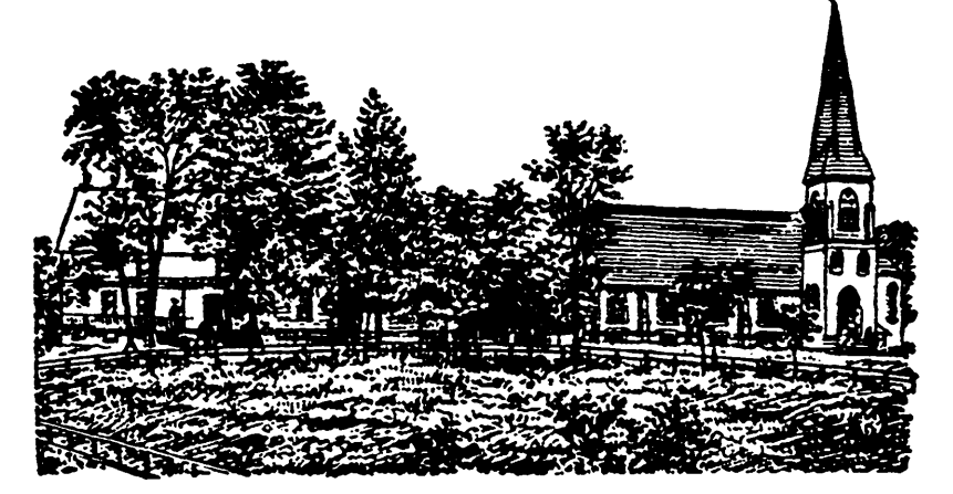
A CANADIAN COUNTRY CHURCH AND PARSONAGE.

"During the twenty-nine years under review, the Diocese has lost largely by emigration, and the city of Quebec, which