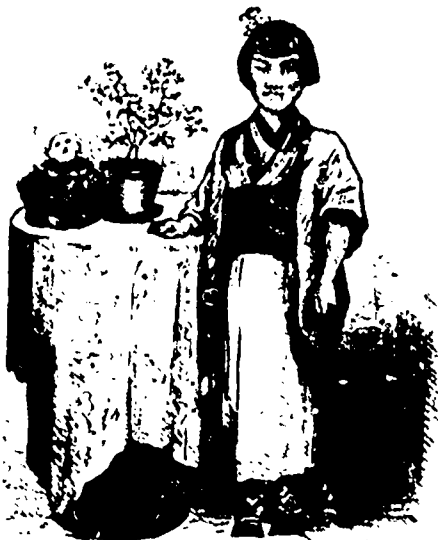
A JAPANESE GIRL.