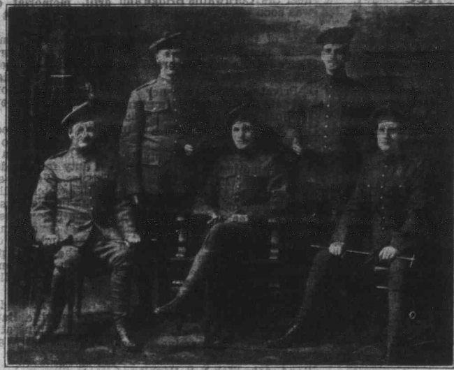
Water Testers A. M. C., 85th Batt., C. E. F.