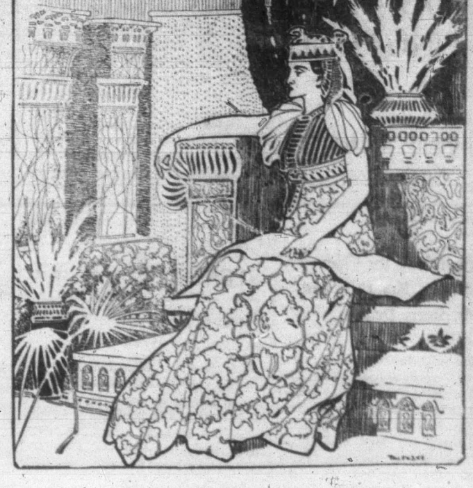
WHERE IS THE SLAVE BOY?" FIND HIM. In yesterday's puzzle Marie may be found by using the left-hand side of the picture as base. She is then in the lower left-hand corner.

The carrier leaves the town postoffice after the arrival of the moining mail and returns in time for the evening mail. Not only does he drop, letters, etc., into the farm boxes, and collect from them, but he carries the farmers the daily weather fore- tution, even to cancelling the stamps