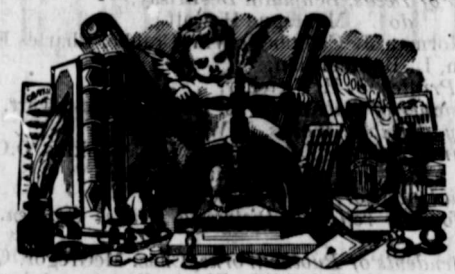
You will find at the "Diamond,"

85 North Side Queen Square, Charlottetown, P. E. I.