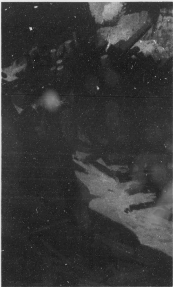
THE GIRL CAUGHT JOE'S ARM. "IT'S GOING OUT, JOE! IT'S GOING OUT! OH, SEE IT PULL!"