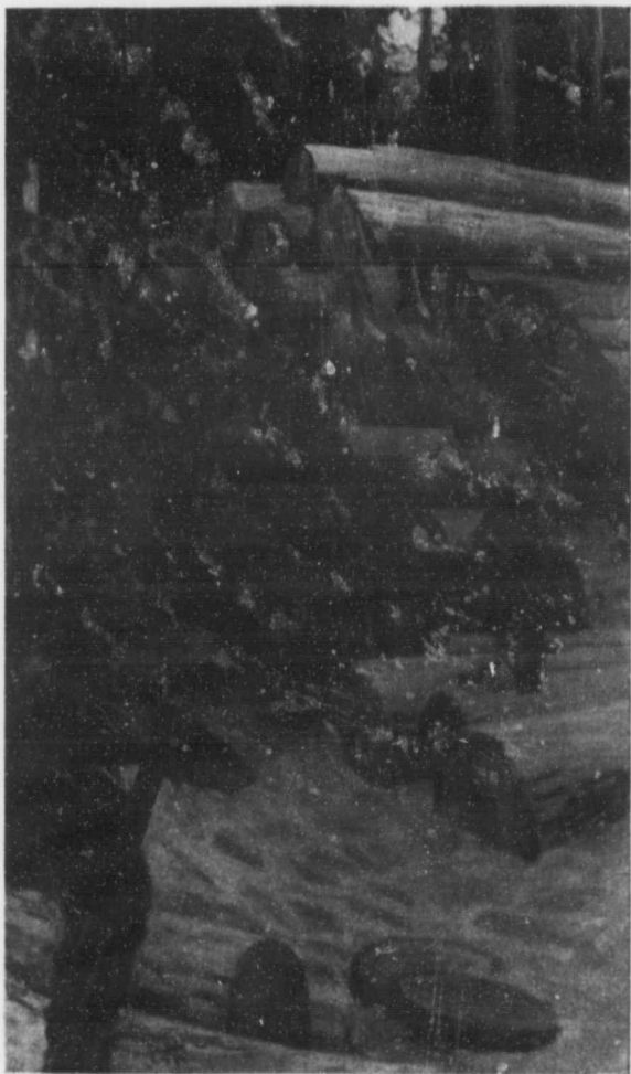
HAGGARTY AND ROUGH SHAN, LOCKED IN A DEADLY GRIP, FOUGHT LIKE BULLDOGS