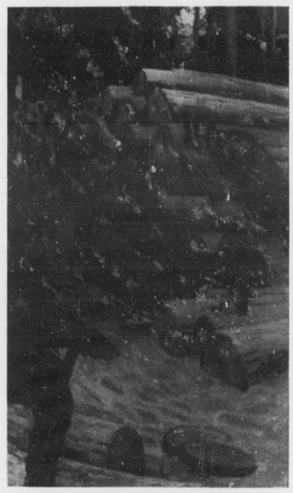
HAGGARTY AND ROUGH SHAN, LOCKED IN A DEADLY GRIP, FOUGHT LIKE BULLDOGS