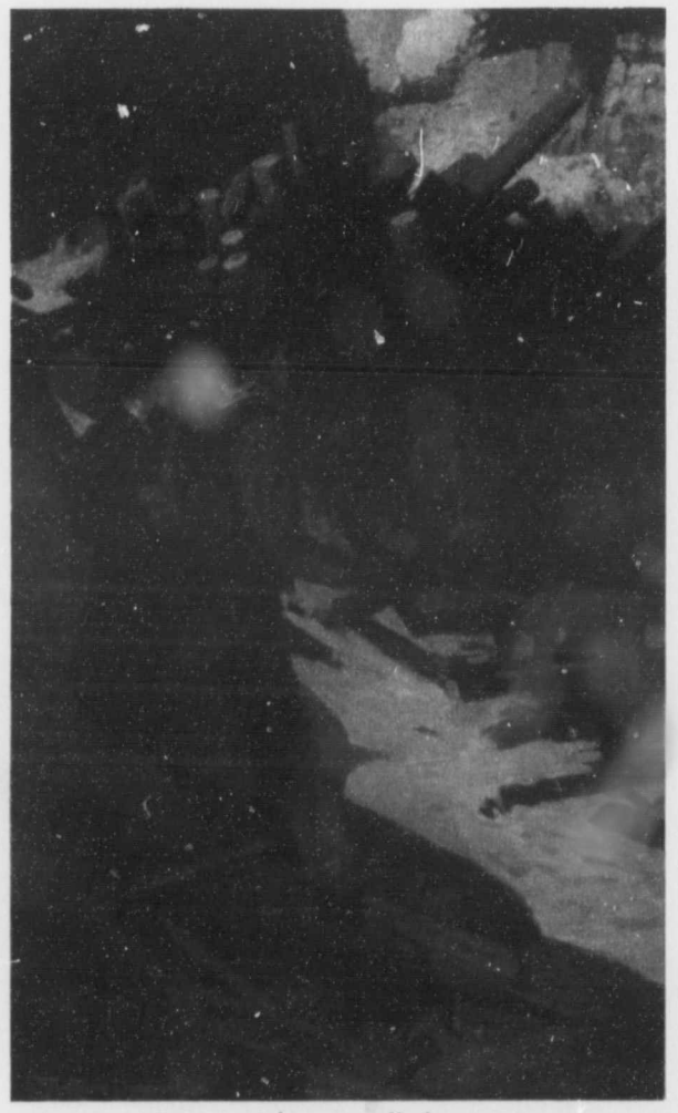
THE GIRL CAUGHT JOE'S ARM. "IT'S GOING OUT, JOE! IT'S GOING OUT! OH, SEE IT PULL!"