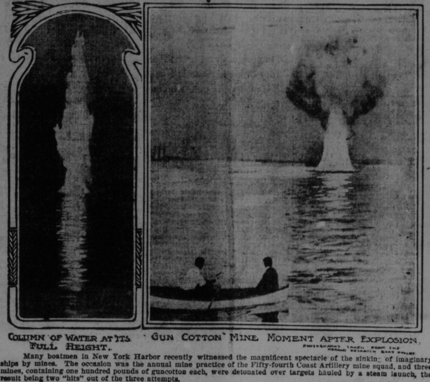
COLUMN OF WATER AT ITS FULL HEIGHT. GUN COTTON MINE MOMENT AFTER EXPLOSION.