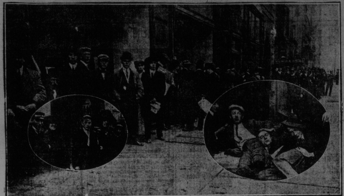
IN LINE FOR TICKETS—WOMEN FANS—IN THEIR EARLY HOURS