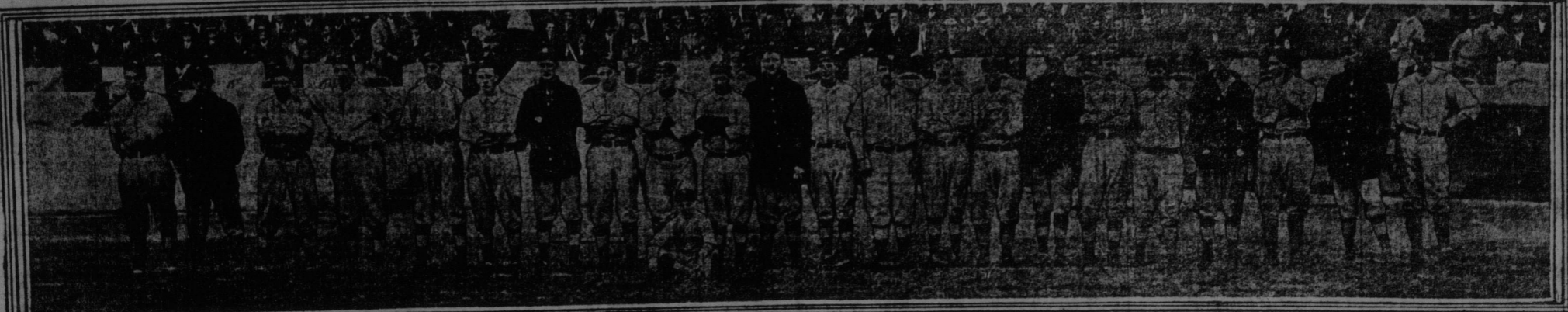
LATEST GROUP PICTURE OF THE NEW YORK GIANTS WHO WON SATURDAY'S GAME.