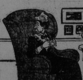
Servant—"If yer please, mum, 'ere's the delegates of the domestic union come to see you about that little shindy you and I had last night."—London Opinion.

Paris, Oct. 16.—The date of the wedding of the Archduke Charles Francis Joseph, the future heir-apparent of the Austro-Hungarian throne, and Princess Zita of Parma, which was originally fixed for October 4, the name-day of the Emperor, and postponed to the 23rd or 24th of October, has again been changed. It is now stated that the marriage will not take place until the end of October. The Emperor, who will be present at the ceremony at the castle of the bride's family in Schkmarau, will stay at Godeole for three weeks in October, returning to Vienna about the end of the month. The Emperor's wedding present to Princess Zita will be a diadem in brilliants, worth $18,000.