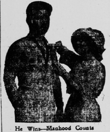
He Wins—Manhood Counts