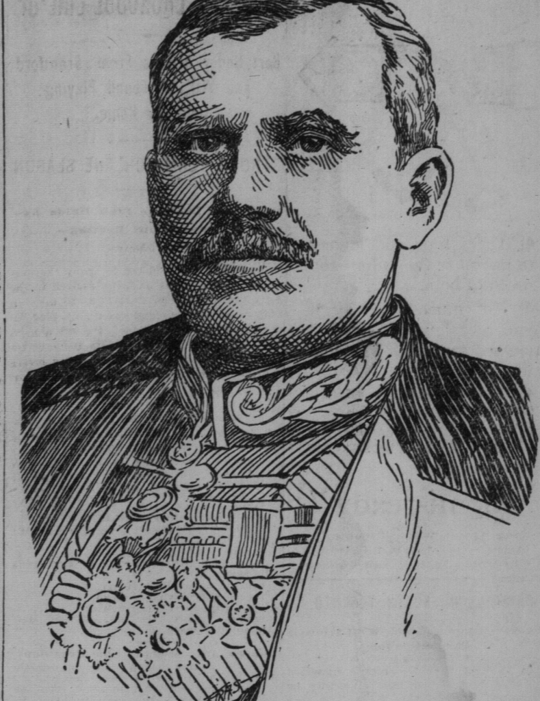
MAJOR-GENERAL SIR HECTOR MACDONALD.

Nothing could be done for them, had no means of doing it. In his thirty years' experience he has known nothing to approach the present situation. The farmers are willing to pay $20 to $25 for men, besides giving them board, washin' and laundry. A personal visit is thought to be more effective.