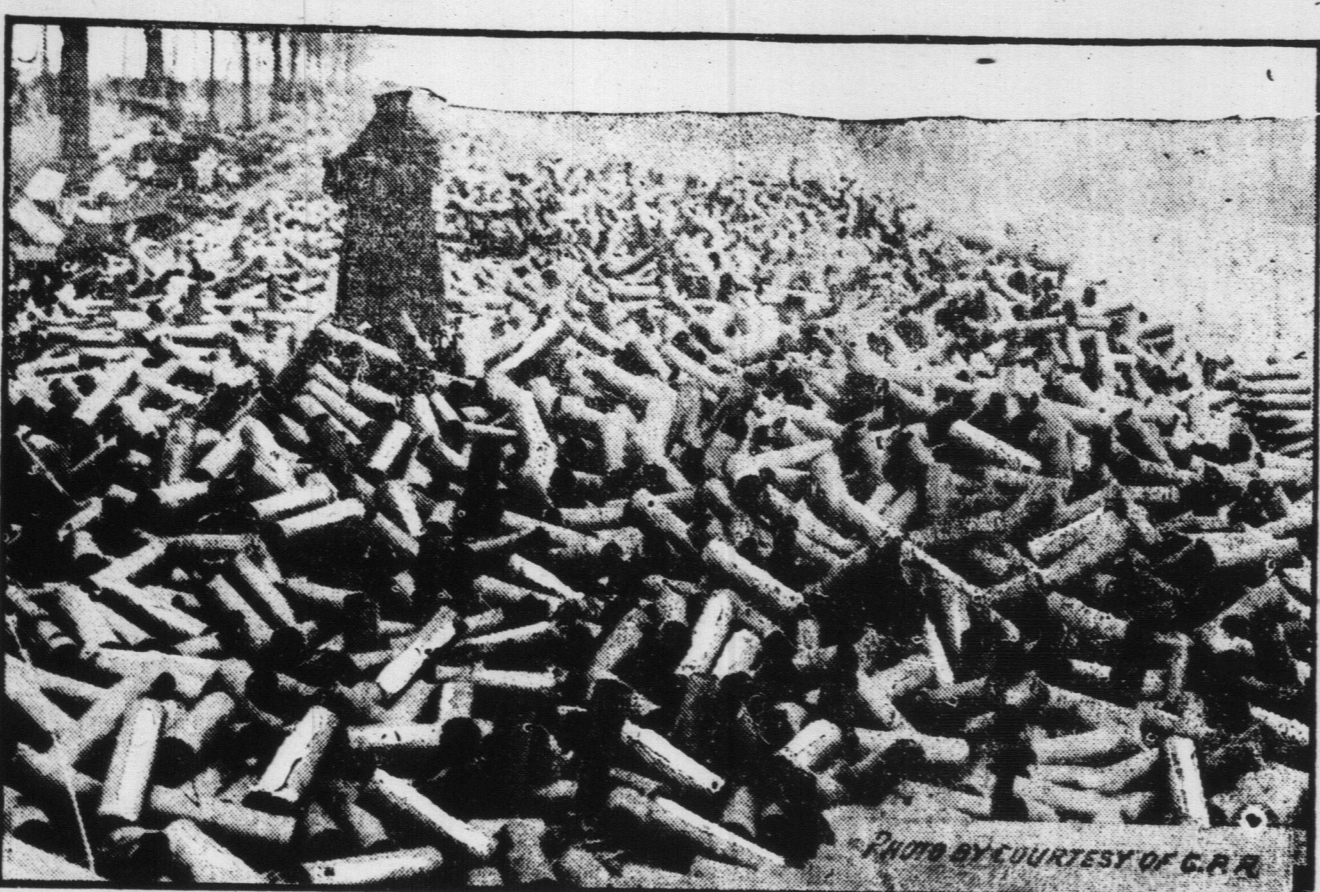
Some shell cases on the roadside in the front area, the contents of which have been despatched over into the German lines.