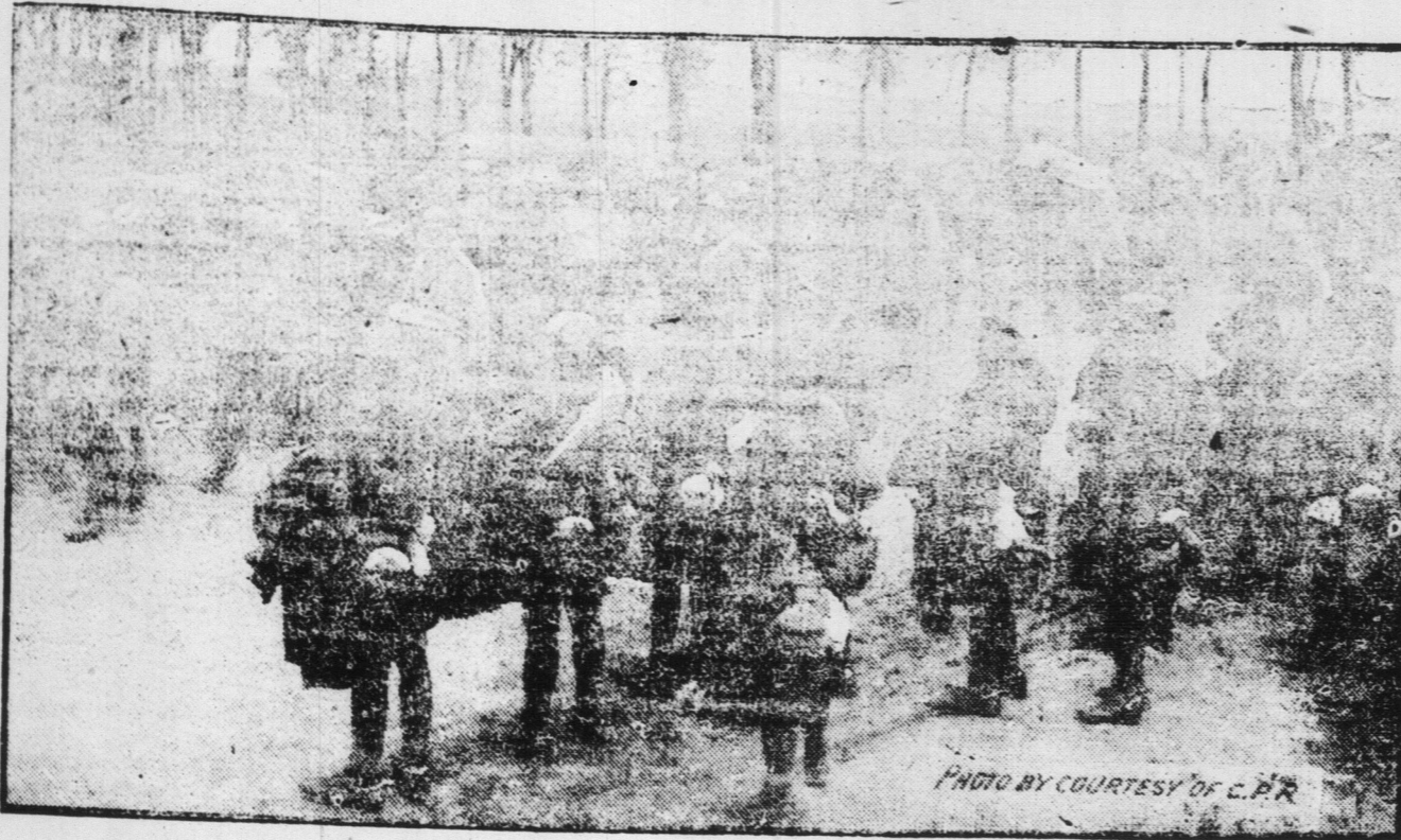
On the British Western Front in France.—French troops on the roadside moving up with British Tommies near the line.