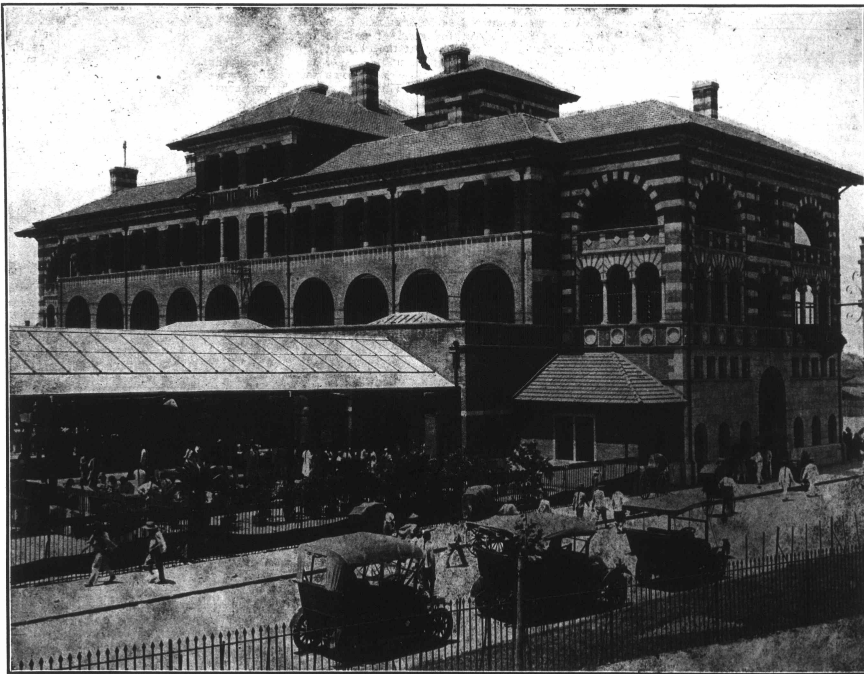
IN MODERN CHINA—An Instance of the Adoption of Western Methods at the Railway Station at Shanghai.

As these new schools have been the centres of progress and revolution, it will be well to examine them a little more carefully. A committee of three great scholars was appointed to draw up a scheme of education, and, all things considered, did a remarkable piece of work. It included everything—primary schools, secondary schools, colleges, normal schools, universities. It is unnecessary to say that it has not been fully carried into effect, but a large part of it has, and progress is still going on. Two great difficulties faced the nation in this attempt—the lack of text-books and teachers. There were, to be sure, certain text-books, which had been prepared by missionaries, available, and some of these are still largely in use; but many more were needed, and, naturally, the Government preferred books by its own scholars. They have been prepared in great numbers and published by Chinese publishing houses mostly in Shanghai. Virtue is inculcated in these books, but chiefly the newly-discovered virtue of patriotism. The Readers are full of little stories of patriotic men and women, and under the guise of