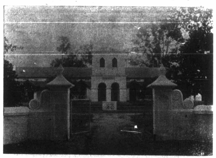
. Albert Boulter Memorial Home, Ramachandrapuram, India.