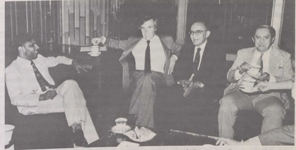
Ministers take a break at Manila meeting: (left to right) Singapore Foreign Affairs Minister Dhanabalan, Canada's Secretary of State for External Affairs MacGuigan, Thai Foreign Minister Siddhi and Malaysia Foreign Minister Rithauddeen.