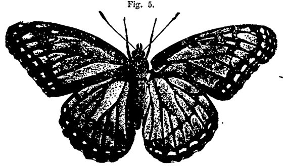
Fig. 5 represents the distipus butterfly. The ground color of the wings is a warm orange red, with the veins heavy and black, and the margins spotted with white. In the figure the left wings represent the upper surface, while those of the right, which are slightly detached from the body, show the underside; the two surfaces differ but

very little in color or markings. The butterfly appears on the wing rather late in the summer, when it may frequently be seen hovering about willow bushes, on which the female usually deposits her eggs, that being the favorite food plant of the larva.