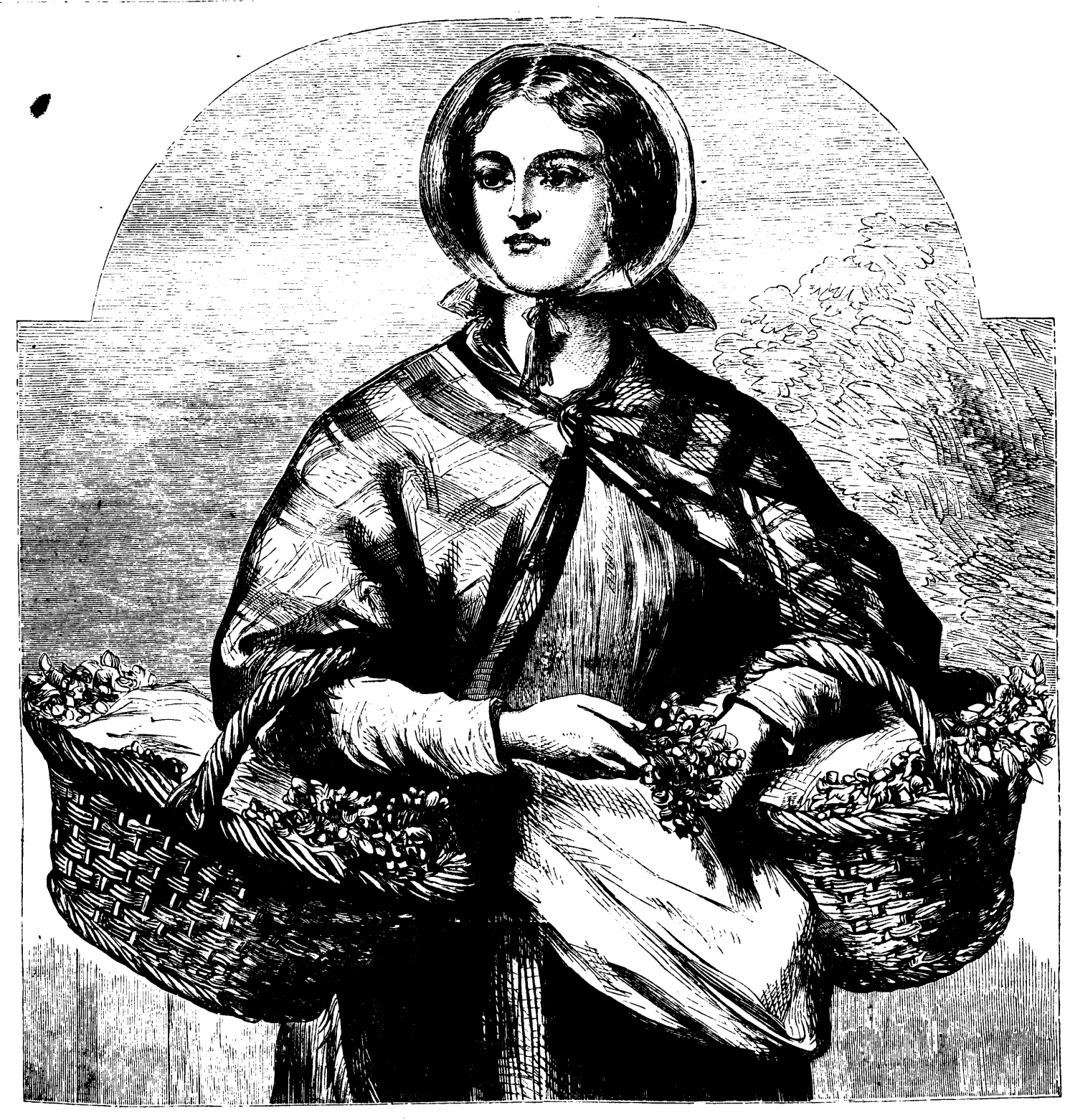
For the Sunday-School Advocate,