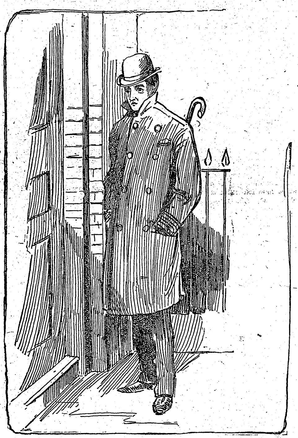
'IT ENDED IN HIS GOING TO THE CLUB DOCTOR.'

It did occur to him that to go out and get drunk would be a very good way of forgetting unpleasant thoughts. If he had run into this danger by mere accident, he might perhaps have taken that way; but now he felt a sort of unwillingness to spoil what had been meant well in that fashion. 'Nay,' he thought; 'I meant it on the right side. I'll face it out and take the consequences, and