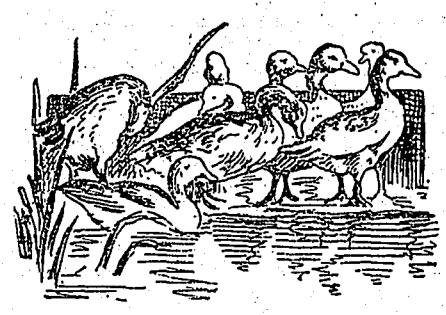
THE WHITE SQUADRON.

Ethel has seen the White Squadhe could discern a small black ob- ron many times. She loved to look down on the harbor and see the