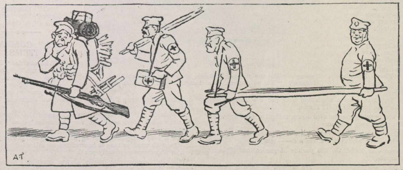
One of the draft (first time in, and feeling depressed by the composition of his body-guard): "Say, fellows, is the 27th giving any transfers into the Mechanical Transport?"

The burning question of the moment: Is measles a "blighty"? An "A" Company N.C.O. must think so. As soon as one section was quarantined he rushed in to participate in a poker game.