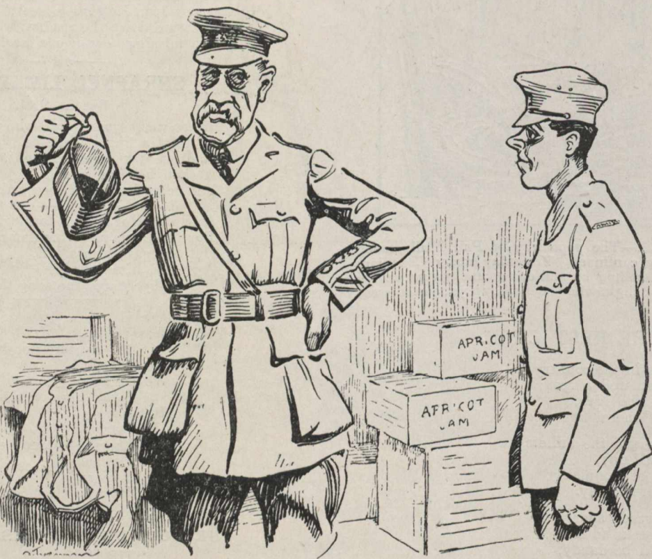
Q.M.: "I can't give you a new tin without the lid. Where is it?" Tommy: "Weel, Sir, ye see it wiz like this. Up I goes and drawed the dinner, when along comes a whizz-bang and takes it oot o' my hand."

Leaving the hall, we marched from the town as night was setting in. All the hills seemed to crowd in close as it grew darker, but as we marched the moon rose in the dark blue sky, and the stars became bright and numerous. At such times the thoughts fain do drift afar from scenes of war, and seek those channels rich in store of memories of the life that's gone before—old associations, old companions, and home ties. Much good it does a soldier to wander far from the battlefield and lose himself in reverie. Thus light of heart and with a growing weariness did we tread that moonlit land, until at last we came upon our billet. After tea we tumbled in and sank to sleep to dream again of home. A LANCE JACK.