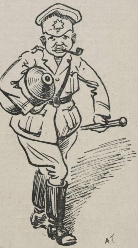
" An Officer with a jolly little demijohn under his arm.