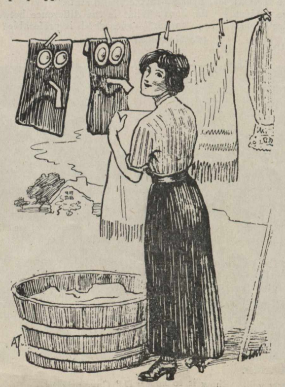
(See Whiz-Bangs, page 8.)

Who was the private who decided to appeal to the paymaster for more money, as 15 francs was not sufficient to allow him to keep up appearances.