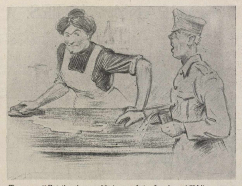
Tommy: "But the change, Madame, of the five franc bill?" Madame: "No, no compris. No change . . . après la guerre!"

Who was responsible for that spy hunt over "The Hill"?