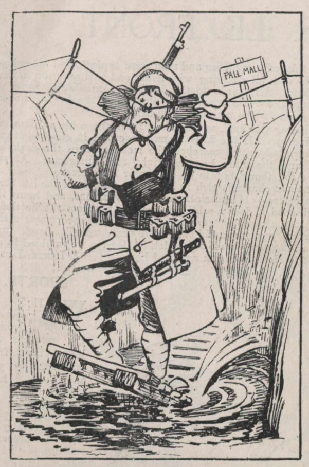
SOCIETY NOTES.—The popularity of Pall Mall among Colonial visitors continues. Yesterday many Canadians were observed strolling up and down, and giving vent to exclamations of delight when held up by objects of interest.