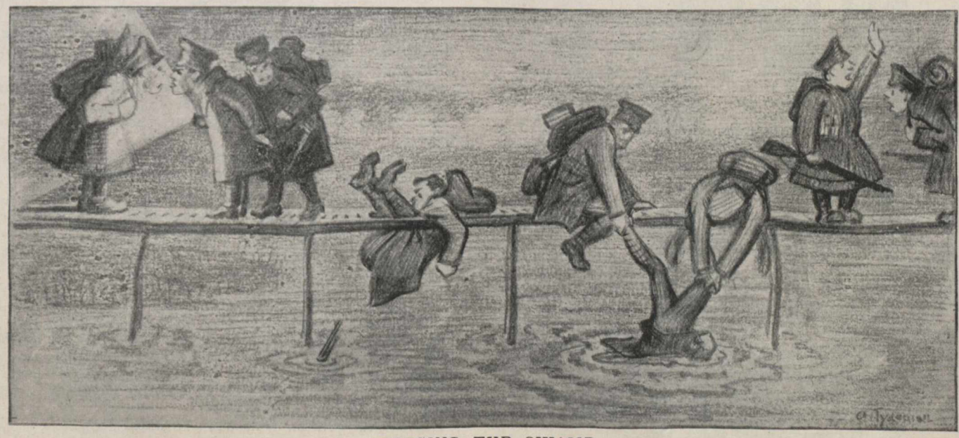
CROSSING THE SWAMP.