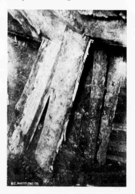
PARADISE MINE .--- UNDERGROUND VIEW INCLINED SHAFT.

trough, but as already stated the deposit has not been sufficiently explored to show its nature and extent. It is a conundrum that can easily be solved by continued development and investigation.