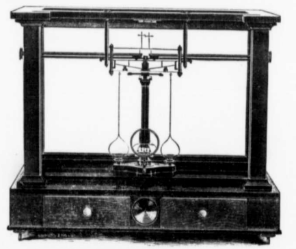
FOUR-INCH BEAM BUTTON BALANCE. The most important improvement is in the base which is extended on either side so as to include the pan-rest

WING to the increasing demands for rapid and accurate work in assay offices, Wm. Ainsworth & Sons, of Denver, Colo., U. S. A., have just placed upon the market a button balance of superior design, with four-inch beam, which may operate faster and swings quicker than any balance now on the market.