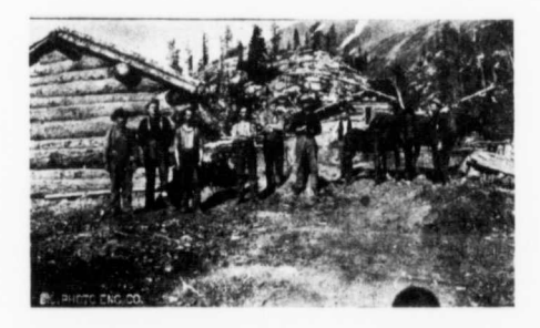
PARADISE MINE.-MINERS OFF SHIFT.

ther crosscutting may discover other ore values similar to that mentioned. No work has yet been done to determine the extent of the ore body referred to. At present the extremity of the tunnel is in a very hard rock seamed with small fissures of quartz.