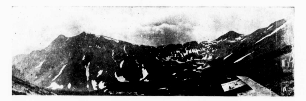
PARADISE MINE. No. 1 Tunnel from which ore was taken, and upper end of Paradise Basin.

opinion that the paystreak, between the slate and silicious lime, will soon be reached. It is the intention to then drift 500 feet which will bring them under the ore shoot in No. 1 tunnel.