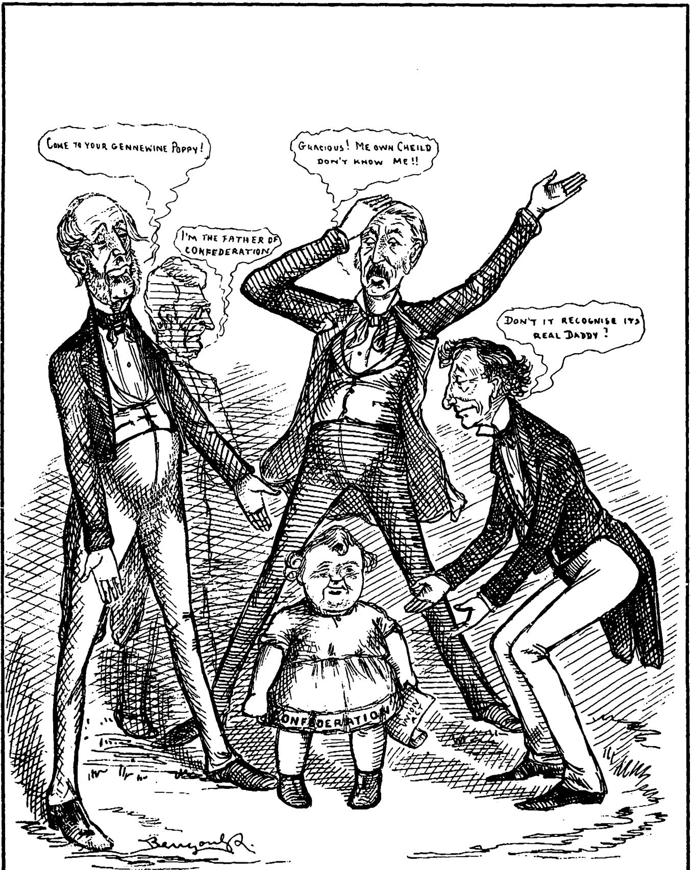
CONFEDERATION, THE MUCH FATHERED YOUNGSTER.