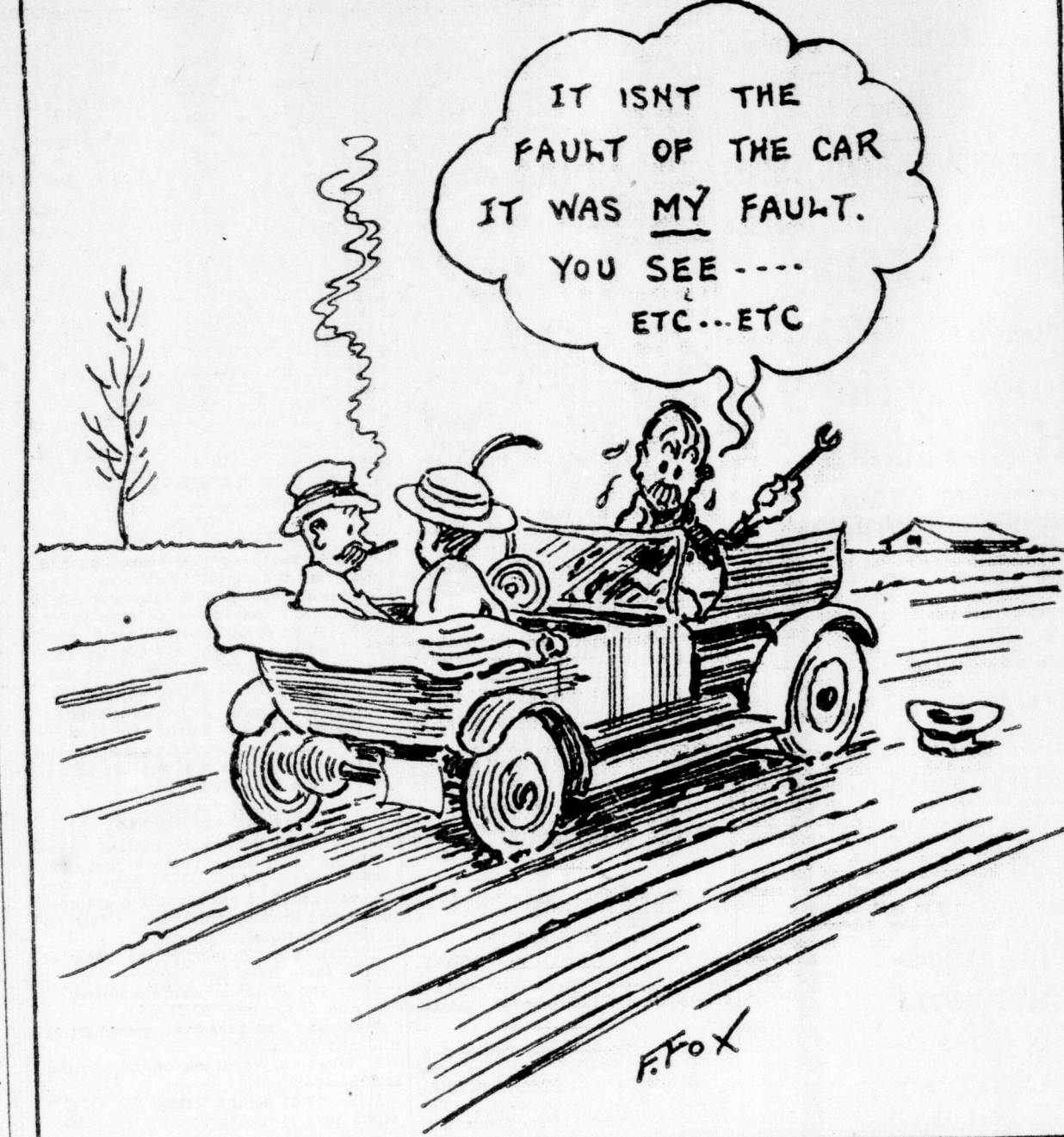
The Advertiser's Daily Short Story (Copyright, 1916, by McClure Newspaper Syndicate)