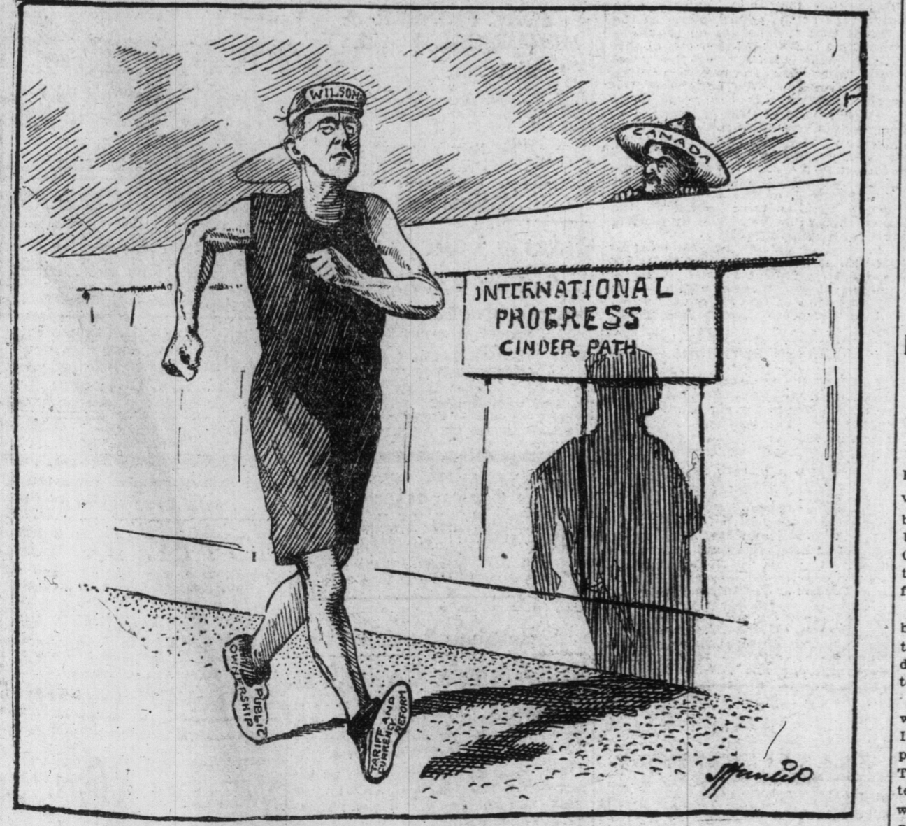
JACK CANUCK: But where's my champion?