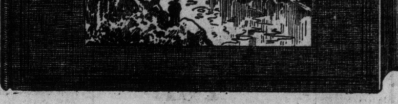
This Greatly Reduced Illustration Shows the Large Volume, Which is 9 x 12 inches—Double the Dimensions of the Usual Size Novel.

Presented by Daily Newspapers From every province of Canada to the countries of South America trainloads of these books are being distributed to newspaper readers.