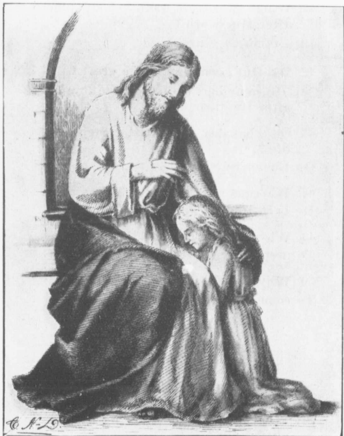
Jesus pardons the child who makes a good confession.