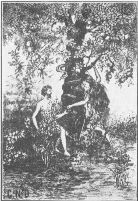
Adam and Eve, our first parents.