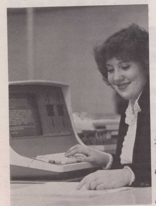
Information is entered into computer at Bailey & Rose Limited.

"The initial thrust will be into the business market but the potential for