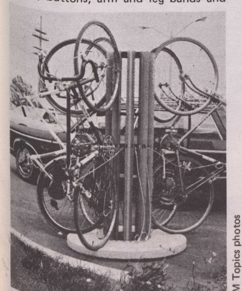
The pedestal bike rack fits into a parking space and can hold up to ten bicycles.

Besides the BIKE-UP racks, Smith is involved with bicycle safety and has developed a series of accessories for cyclists which are made from retro-reflective material. Among Smith's safety items are flash flags, streamer flags, handlebar jets, badges, buttons, arm and leg bands and