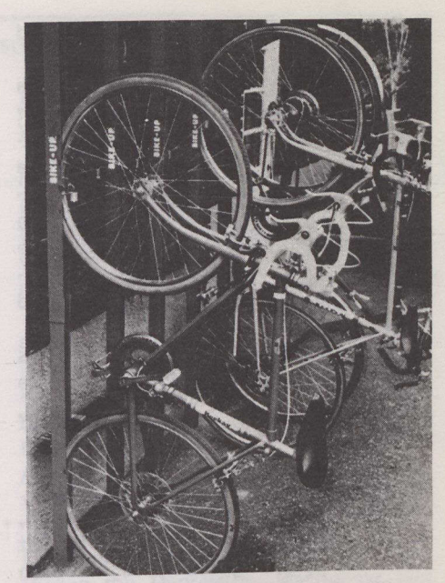
The BIKE-UP storage rack can be affixed to almost any solid flat surface.