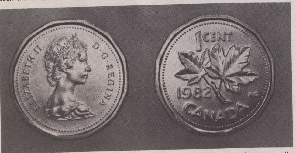
The Royal Canadian Mint has changed its one-cent coin so that it can be more easily recognized by the blind; the pennies have been easily confused with dimes. Instead of being round shaped the coins now have 12 sides.

Alguns artigos desta publicação são tambél editados em português sob o título Notícias Canadá