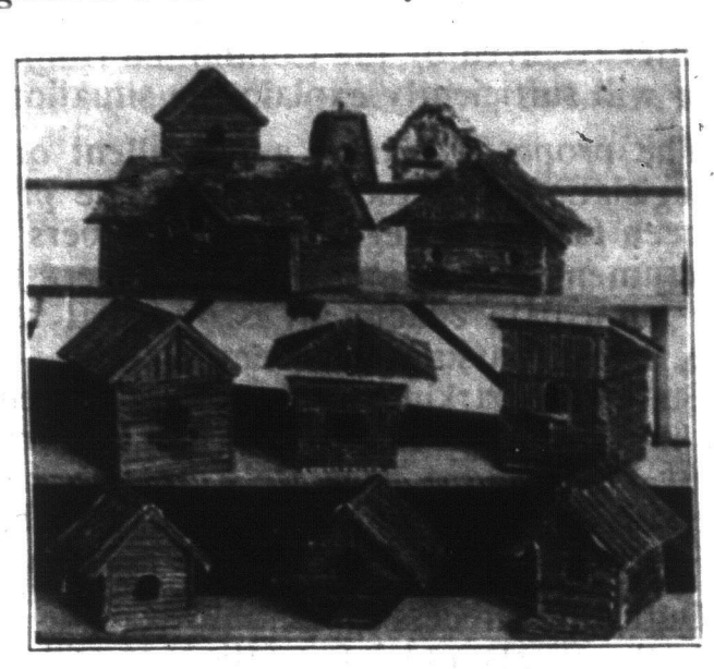
RUSTIC HOUSES

In general bird houses vary in area of floor space,