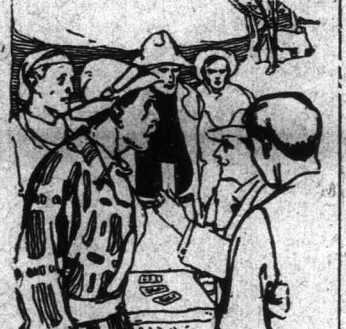
Hold up the Jack of hearts.

NEWMARK followed the thirty-three days' work of the log drive with great interest. Gradually the men got used to him and ceased to treat him as an outsider. The drive went down as far as Redding in thirty-three days. The men worked fourteen and sixteen hours at a time.