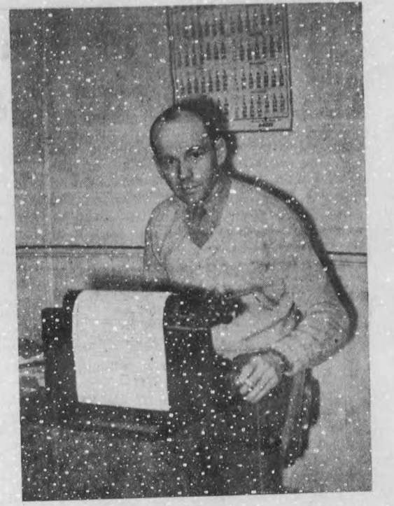
Compliments of Year Book