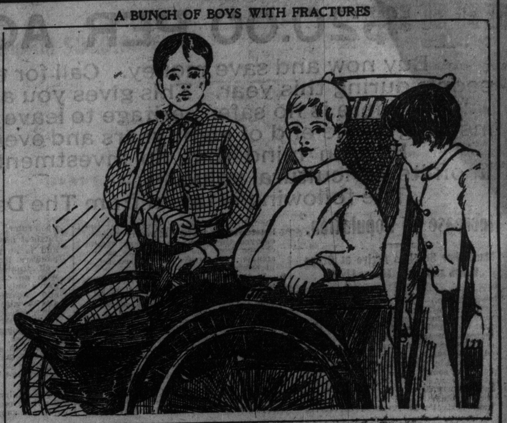
TWO BROKEN LIGS AND ONE BROKEN ARM.

Give, for your dollar will help save many little ones from a joyless life and early grave.