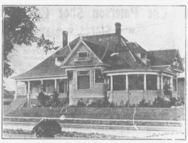
P. O. Box 219