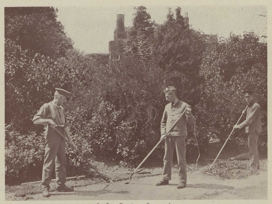
Out-Door Exercise at Kingswood.