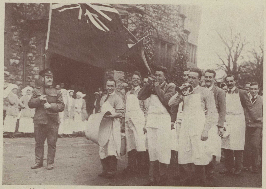
Mess Orderlies in their serving aprons. Sisters in the background in Main Entrance Porch.