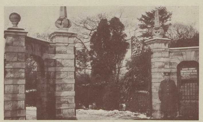
Entrance Gate, Kingswood Road, with one of the patients on duty as Military Policeman.

mostly spent for educational and charitable