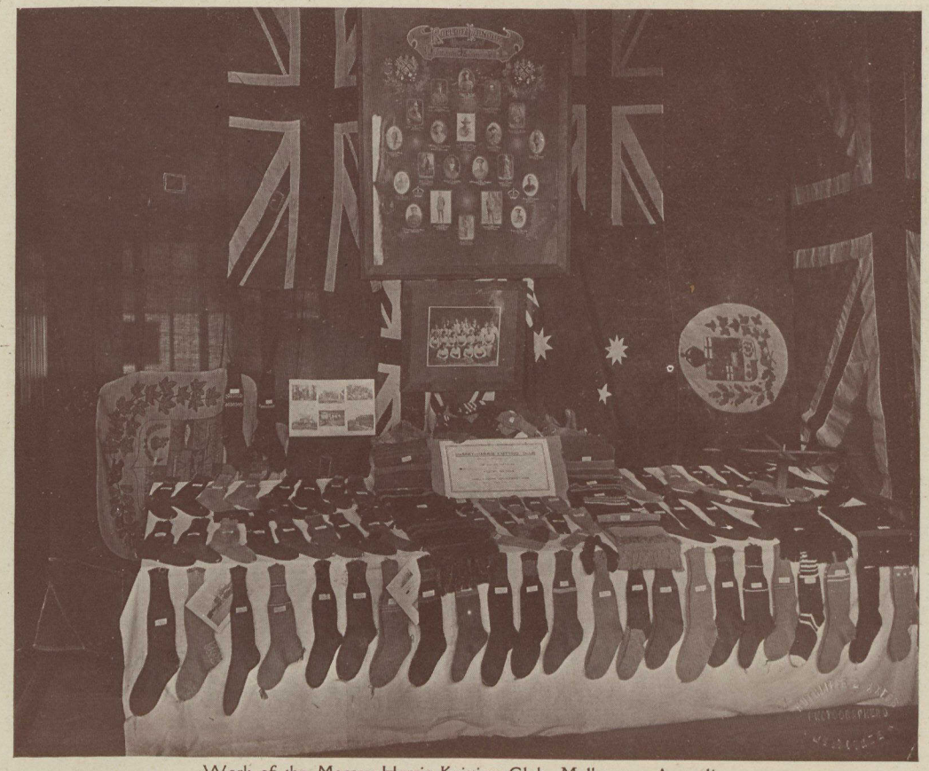
Work of the Massey-Harris Knitting Club, Melbourne, Australia.

being wounded. He is 23 years old, and his parents live in Buxton, England.