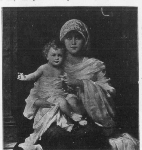
THE BABE OF BETHLEHEM

The choir were to sing while the people were gathering, and we came in just as they were taking their seats behind the organ. The meeting was held in the large Sunday-school