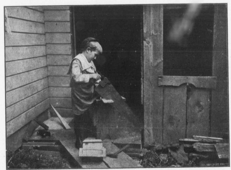
TRYING THE TOOLS LEFT BY SANTA CLAUS

It had been previously decided that the total gifts would be divided among the Methodist Deaconess Orphanage at Lake Bluff, Ill, the Old People's Home at 975 Foster Avenue, Chicago, and the Chicago Deaconess Home at 227 East Ohio Street, Chicago.