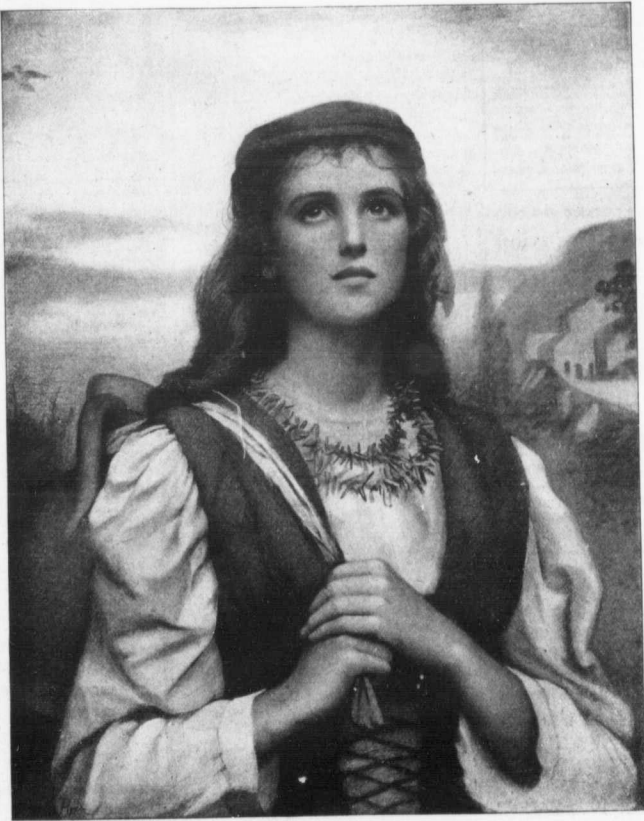
"God's in His heaven."