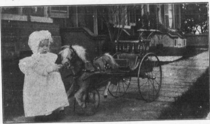
FEEDING THE HORSE (CHRISTMAS MORNING)

I trust that other schools will try this plan for their Christmas entertainment, for I am sure their verdict will be the same as was ours-"the best time we ever had"-so well pleased that a similar plan his been unanimously approved for this year .- Northwestern Christian Advocate.