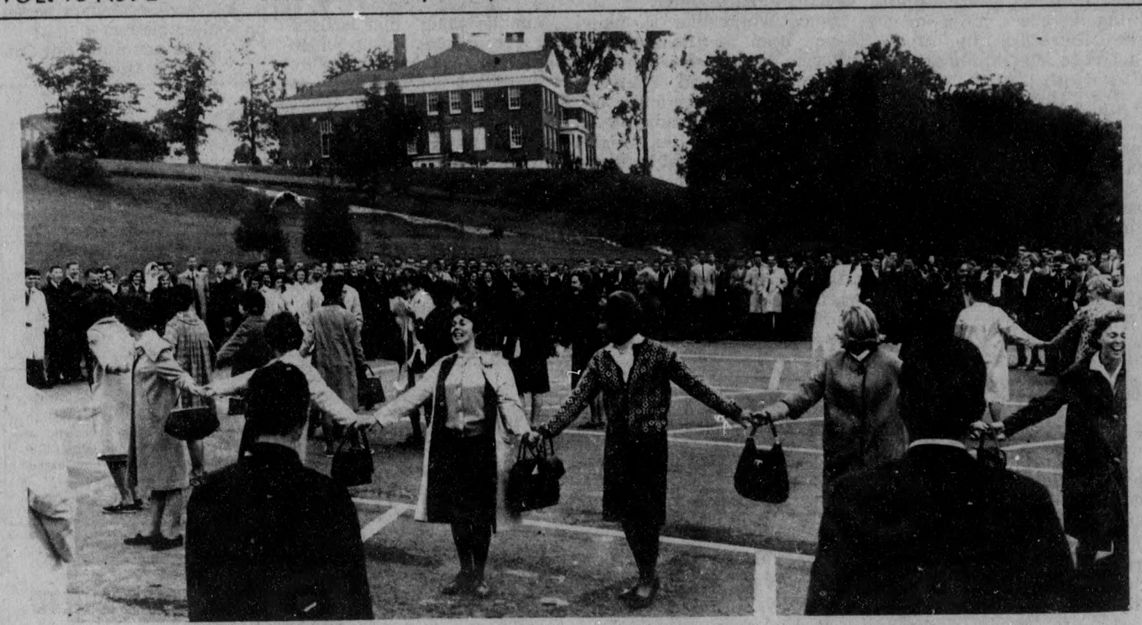
The style of purses is evident here in this bevy of beautiful maidens