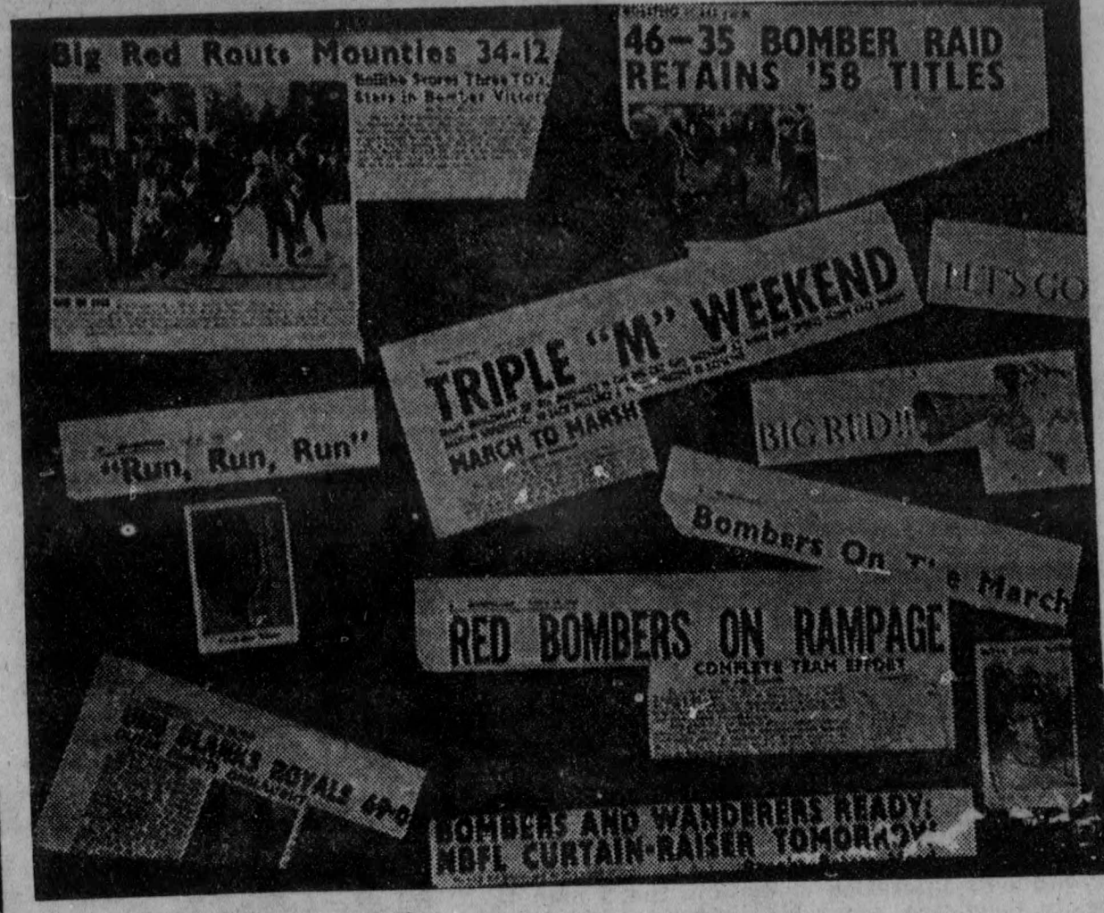
FANS ARE HOPEFUL OF SEEING THIS AGAIN

This article is intended to stimulate the cynics on campus into coming to observe and judge for themselves at the season opener against Mt. A on Sept. 28. I extend the best wishes of the Brunswickan Sports Staff to the Red