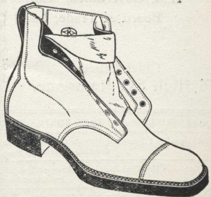
"K" Service Boot

Campaign, Riding, Dress and Long Boots always in stock, in sizes and half sizes