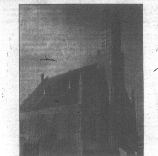
NORTH SYDNEY, C. B. BAPTIST CHURCH.