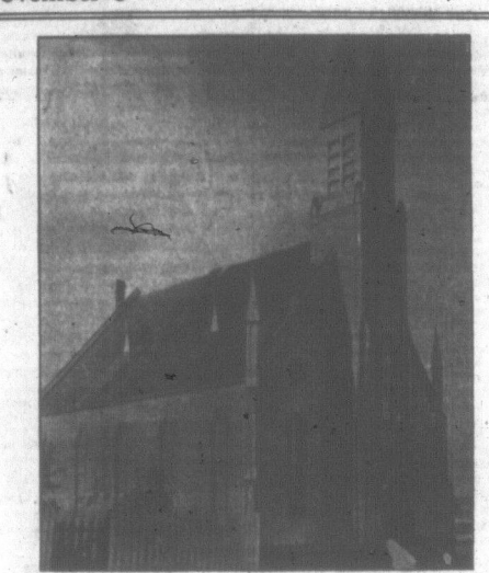
NORTH SYDNEY, O. B., BA PTIST CHURCH.

prier has removed from gewater, Lunenburg Co., of the pastoral charge of that place. His corres-lease note the change of