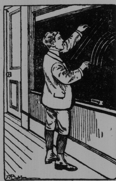
DRAWING WITH BOTH HANDS.

er illustrated his talk with chalk drawings upon a blackso. While his right hand was producing one side of a picture the left hand