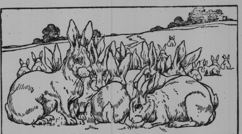
The illustration shows a number of rabbits in a field. See whether you car

way it ought to be with us all. ever, especially by young people. In hard as you can, keeping the elbow to write call "pothooks." At length some schools teachers are already joints stiff. Shake hands and fingers as though you were trying to shake them loose from the wrist. That is good for both hands. Here is another that all young people ought to practice: Stretch the fingers of both hands as far apart Another: Hold your extended fingers together, then loosen one of them at a time from the rest and stick it out by itself; next, the adjoining finger, and continue with all four of them one after