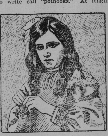
CUTTING THE NAILS OF THE and if only beans fall to her share it RIGHT HAND,

they were right hands, which is the lines at first, straight and curved ones With his right hand he draws perhaps If you want to make both your right | curved lines parallel to one another. At and left hands and fingers limber and the same time with the left he draws plish and hold our thought steadfastly quick raise your arms in front of you parallel straight lines. After awhile he to it, that we can always do. and shake your hands and fingers as makes loops and what children learning