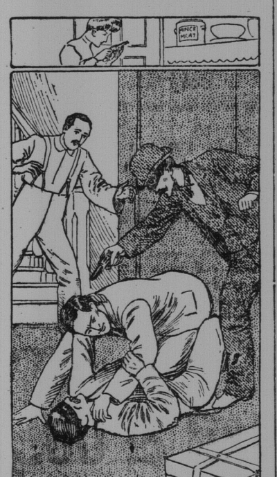
THE THIEF POINTED IT STRAIGHT

To the thieves this was in reality the guard with a revolver in each hand, a dead shot with right or left, and a man peculiarly merciless toward house-breakers. Listening at the door, he had put his shoulder against it, and the pressure had set off the gong. So the thieves were warped away from certain were reliling over and over upon the "Yes, I have," was the reply. "And much obliged, I'm sure. You see, we death and fied through the house to the floor. The revolver had fallen, and the possess."