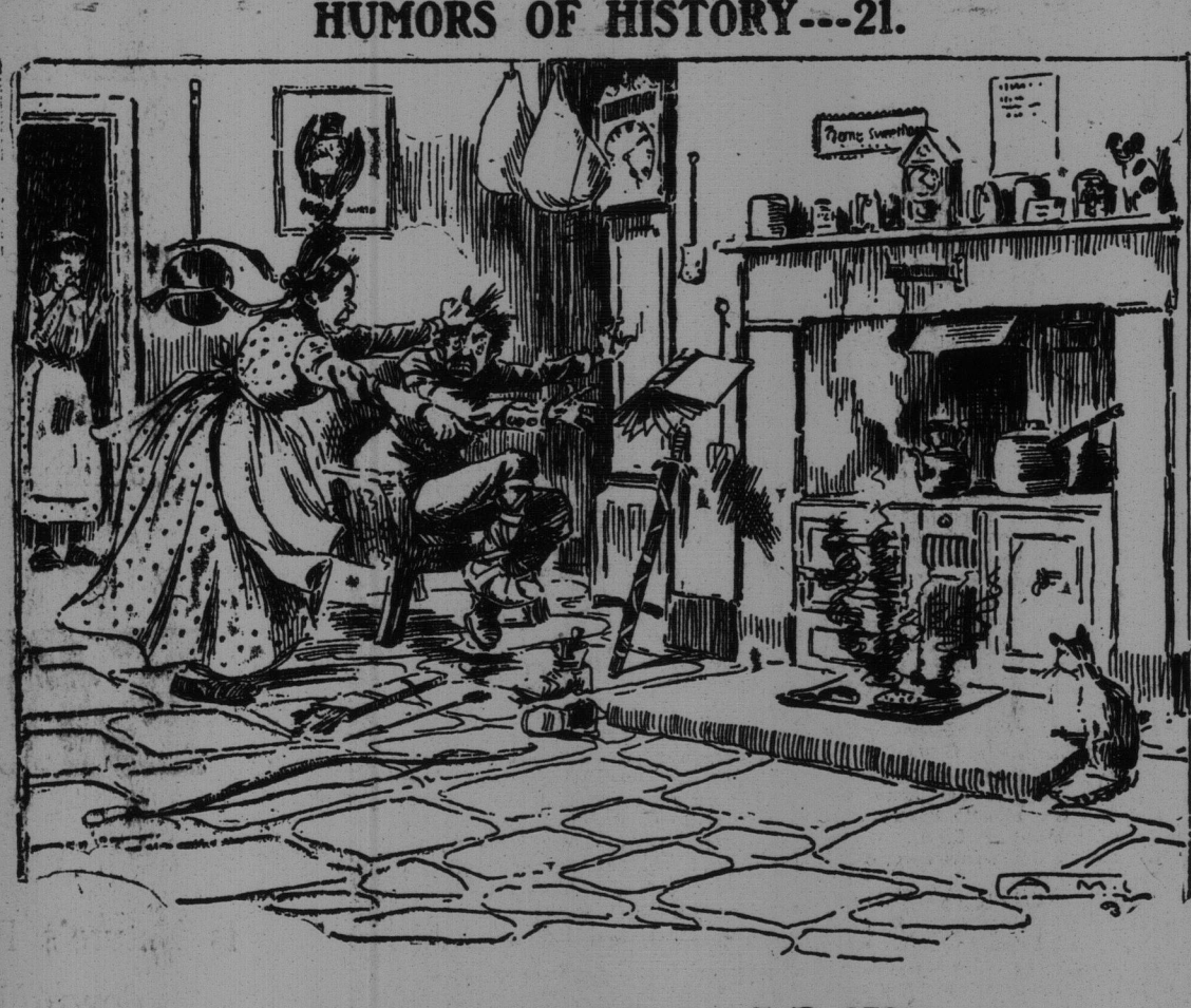
The Burnt Cake Episode. A. D. 878. "Soon after Alfred's accession the Danes again became troublesome and defeated the English. Alfred fled and hid himself incognito in the cottage of one Gurth--a swineherd."