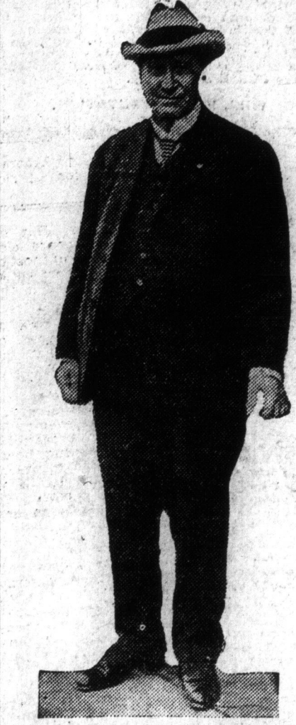
Toronto's Junior Beak