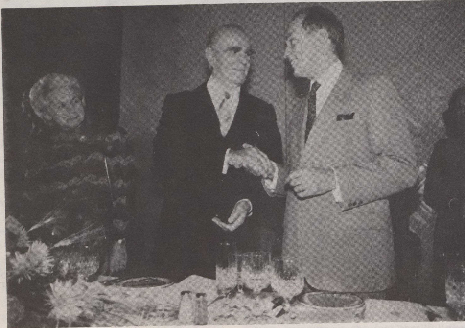
Prime Minister Pierre Trudeau (right) greets Greek President Constantin Karamanlis at a dinner given in his honour in Montreal. Speaker of the House of Commons Jeanne Sauvé (left) looks on.

Greek President Constantin Karamanlis was in Canada, October 14-18, at the invitation of Governor General Edward Schreyer, who visited Greece last May.