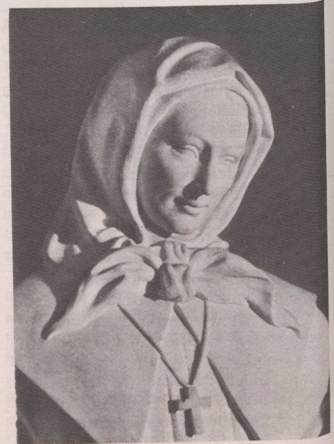
Saint Marguerite Bourgeoys.

Marguerite Bourgeoys was beatified in 1950 and in 1975 a commemorative Canadian postal stamp was issued in Montreal to honour her as a pioneer educator and community builder.