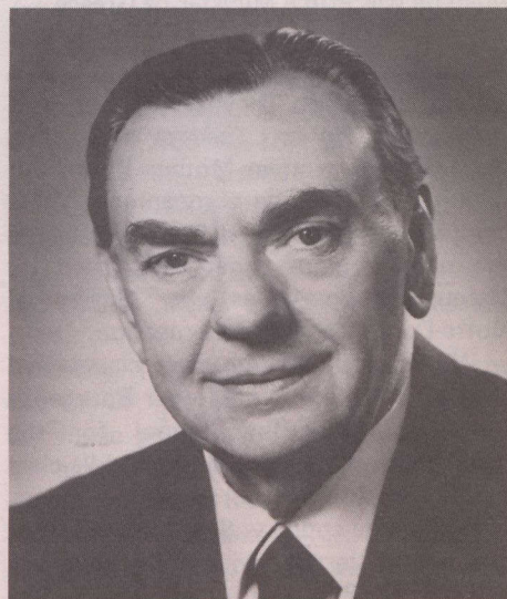
Former Secretary of State for External Affairs Don Jamieson is Canada's new High Commissioner in London.

Mr. Jamieson was born in St. John's, Newfoundland in 1921. Before his first election to the federal government as the Liberal Party representative for Burin-Burgeo, Newfoundland in 1966, he