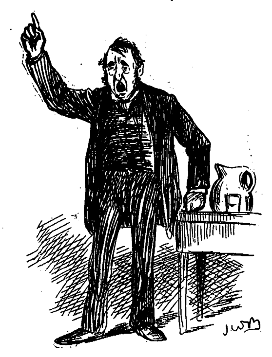
THINGS THAT SLIP OUT WHEN WE'RE WARMED UP.

"Well, no, not as a general thing," replied the Fakir. "But you see circumstances alter cases. Just now the millionaires feel kind of rattled over this Russell Sage