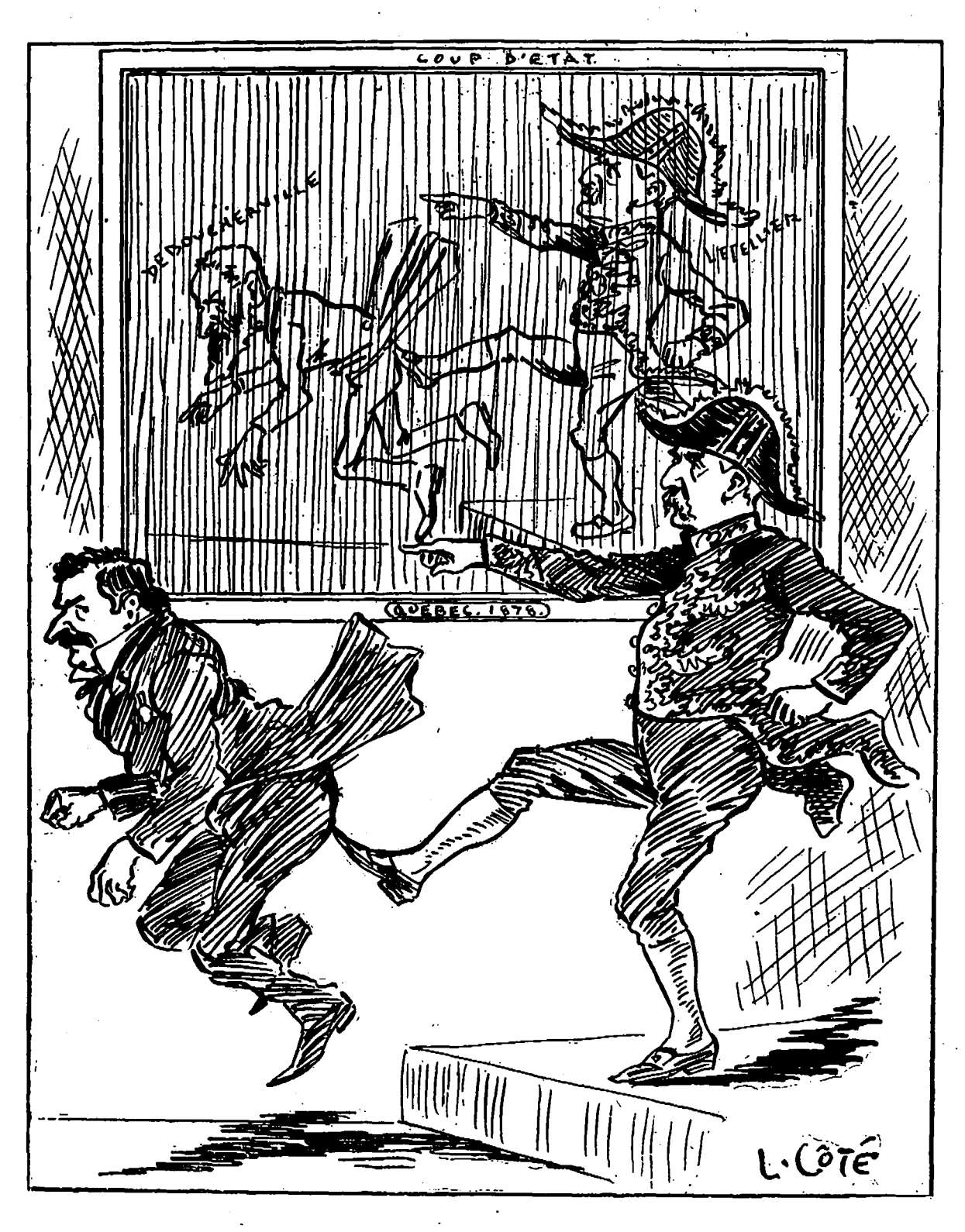
"HISTORY REPEATS ITSELF."