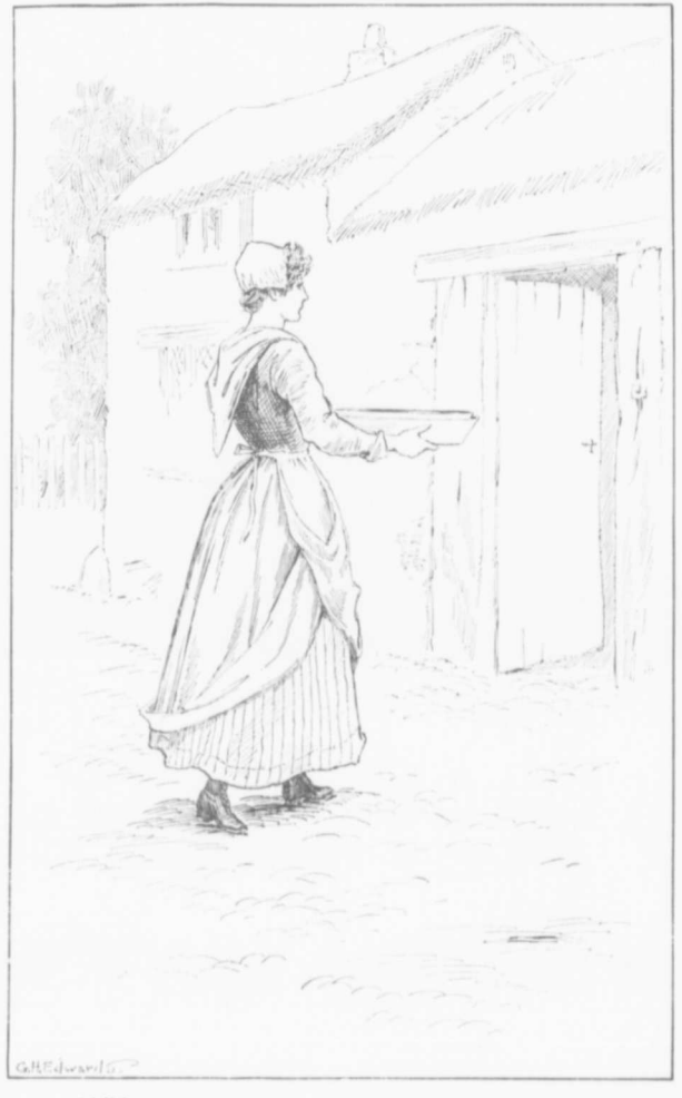
"A light step came quickly over the round stones, and Allison entered." [ Page\ 214*