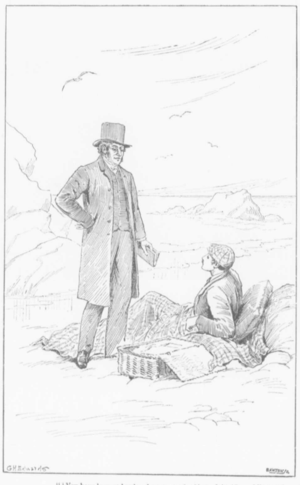
" 'You have been at hard and weary work of late, John." [Page 316.