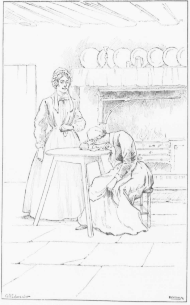
"Allison had sunk down on a low stool."