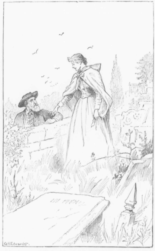
"Allison's sorrowful eyes looked down on him."