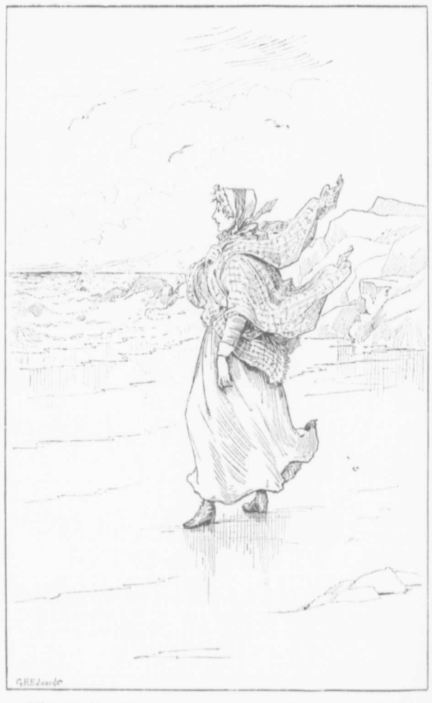
" She wrapped herself up, and went down to the sands. The waves were coming grandly in." [Page 39t.