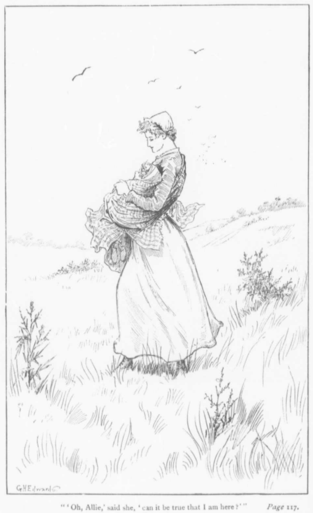
"'Oh, Allie,' said she, 'can it be true that I am here?"