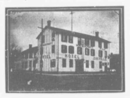
Oakville House, Oakville.

bed-rooms, in addition to commercial sample-rooms. The service is very good and guests can depend upon obtaining satisfactory treatment. For farmers, good stabling