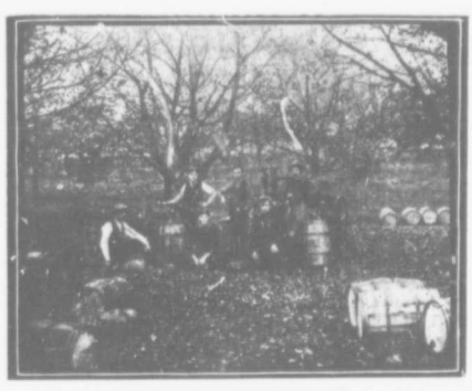
Packing Apples for Market.

MARLATT & ARMSTRONG, Tanners OAKVILLE BASKET CO., Basket and Fruit Packages W. T. CARSON & SONS, Builders' Supplies WM. WHITAKER & SONS, Carriage and Wagon Works COLIVER & CLARK, Apple Evaporators T. H. ASHBURY & SONS, Flour and Grist Mill McDERMOTT & CO., Cooperage Works OAKVILLE ELECTRIC LIGHT & POWER PLANT