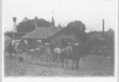
SHIPPING OAKVILLE STRAWBERRIES