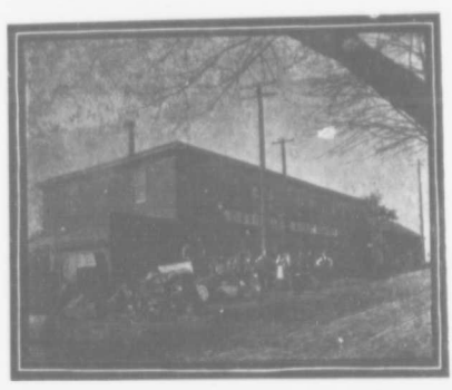
The Oakville Basket Co's Factory, Oakville.

baskets in the Dominion, is the Oakville Basket Company. The works of the company are located a short distance south of the Grand Trunk Railway, and comprise three buildings, with office nearby.