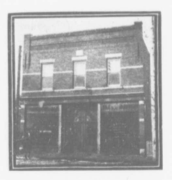
Post Office Flock, Oakville

Persons in quest of information regarding homes, farms, or factory sites, would do well by communicating with Mr.