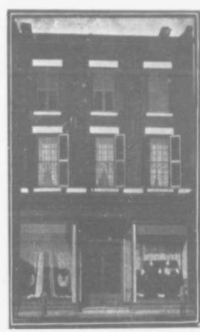
Robinson's Dry Goods Store, Oakville.

modious and well-lighted store is to be found a really excellent assortment of groceries, fruits, flour and feed, tobaccos and cigars.