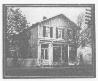
Busby's Jewelry Store, Oakville,

In these various branches, always well stocked, a considerable trade is done every year, especially in watch adjusting, which is a feature of the business, only the best skill is employed.