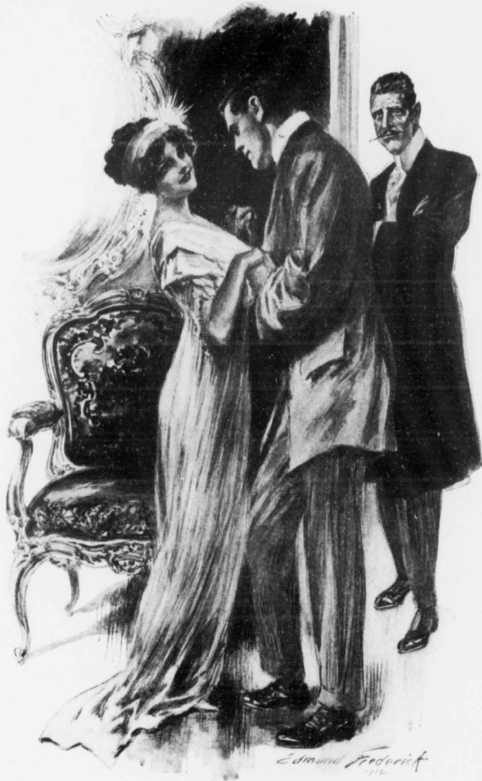
"De Morny's eyes sparkled with anger as he watched"