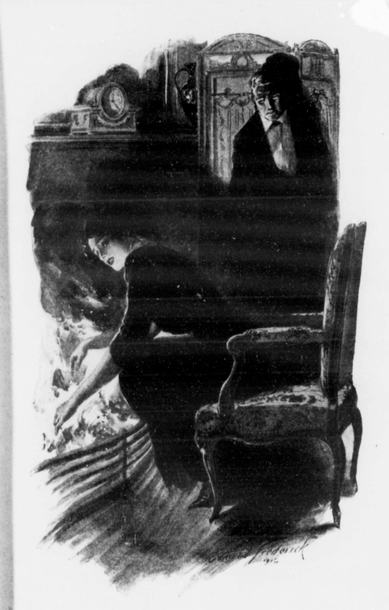
"'How dare he?' she exclaimed aloud"