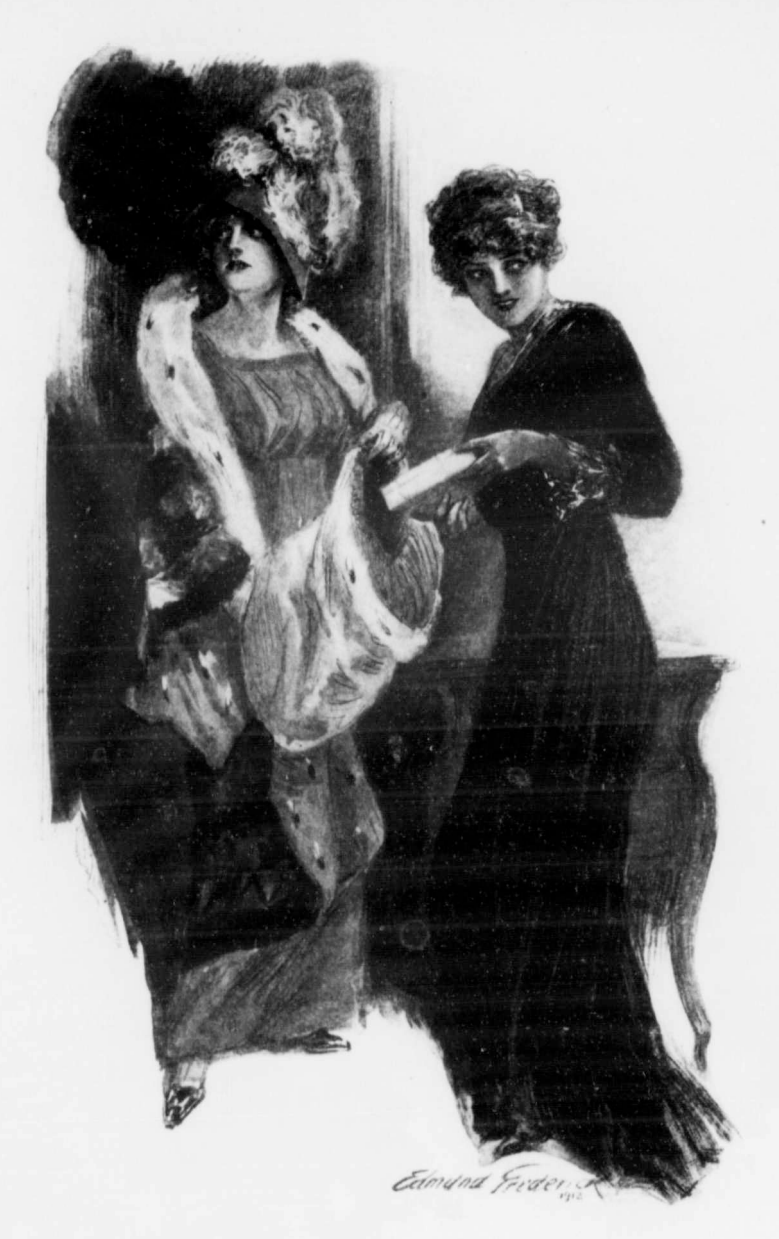
"'I entreat you, Peggy, to take this box'"