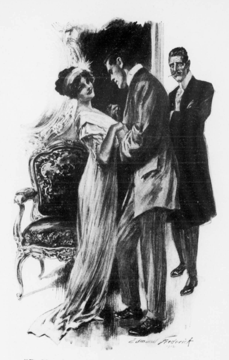
"De Morny's eyes sparkled with anger as he watched"