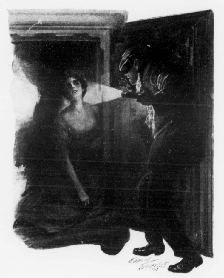
"Eye to eye they gazed at each other—the quick and the dead" $[Page\ 3]$