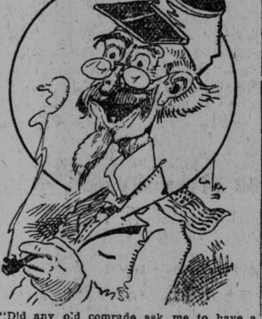
"Did any old comrade ask me to have a drink?"