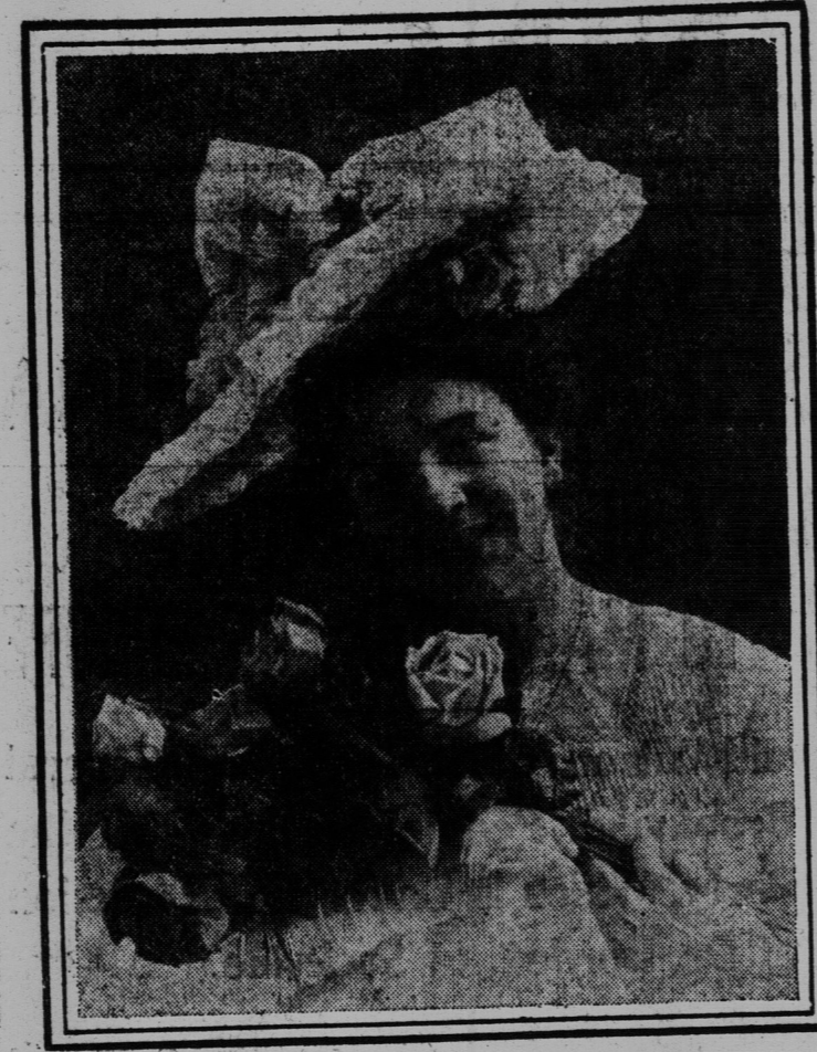
MATCHING LINGERIE HAT.

The lingerie hat is the logical accompaniment of the lingerie frock. Though not necessarily of the same material used in the dress, many of these hats are made this year to match the dress in both material and trimmings. Where the dress is a plain white lawn or batiste, the hat is a picture model, the hat is of the same fabric, shirred over the wire frame which is previously covered with white material in order to hide the wires, and the crown