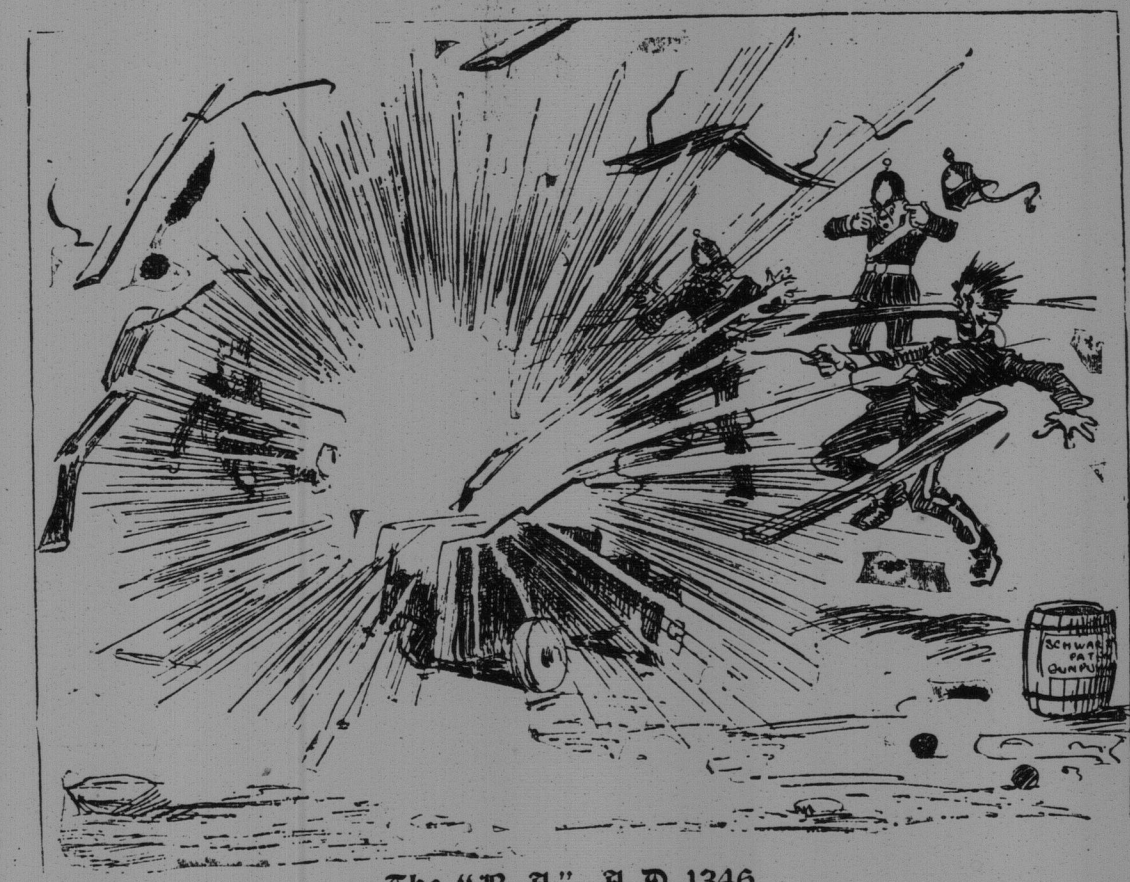
The "R. A." A. D. 1346 The first cannon were made of wooden staves bound with iron.