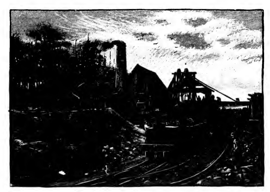
COAL-MINE AT NANAIMO.

The agricultural resources of Vancouver's Island are as yet but little developed; some parts of the country are indeed already cultivated to great advantage, as others doubtless will be before long; but much of it, in the opinion of those who should know, will never repay the labour of clearing. Meanwhile, the forests supply timber in plenty, and will do so for many years to come. The mineral resources are supposed to be very great, and in one important direction they have been developed already. A little railway runs from Victoria for about 70 miles to